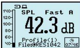
Main result in one profile view

2 with USB 1.1 Host function not active and backlight off